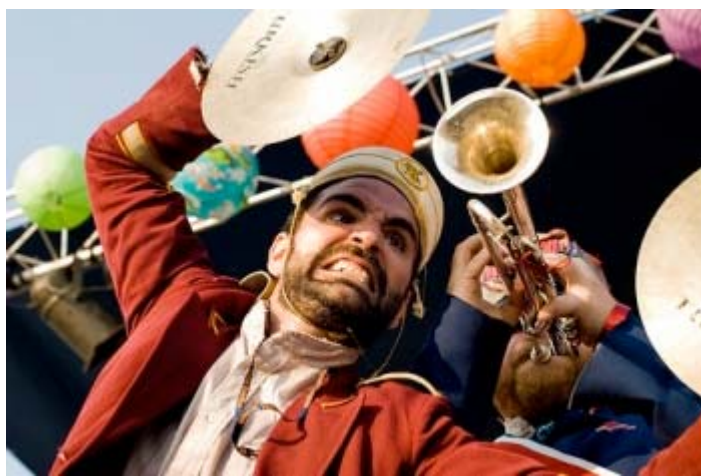
Mucca Pazza